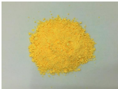
< CELLCOM - KL9/A >