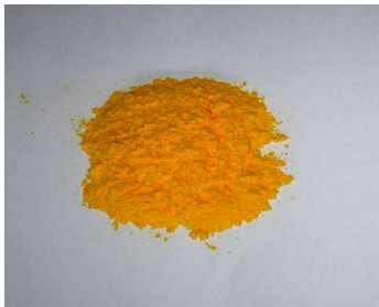
< CELLCOM - AZO/ST >