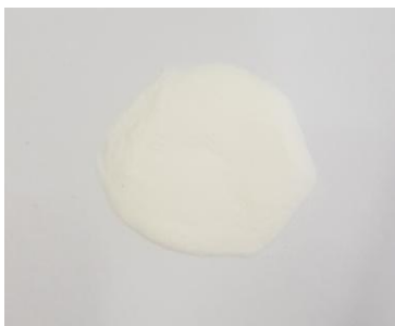
< CELLCOM - CAP/264J >

CAP/264J is a thermo-expandable microcapsule blowing agent.