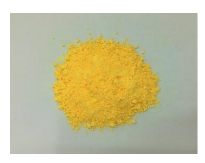
< CELLCOM - A7000SP >