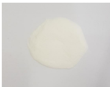
< CELLCOM - CAP/264U >