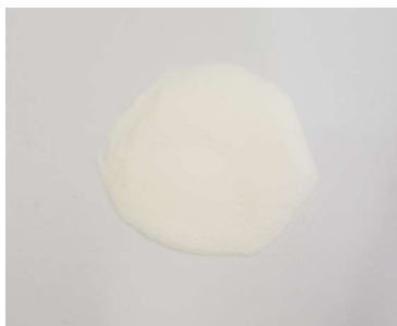
< CELLCOM - CAP/264H >