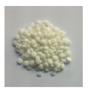
< CELLCOM - HD/765 >