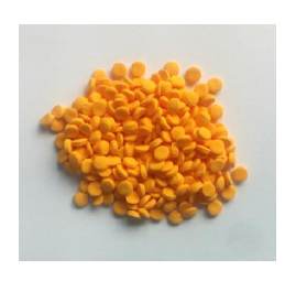
< CELLCOM - EMA/80AH(N) >