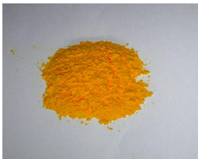
< CELLCOM - AC3000FD >