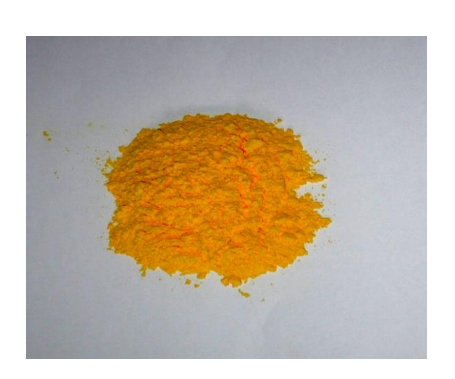
< CELLCOM - ACMP/Alpha >