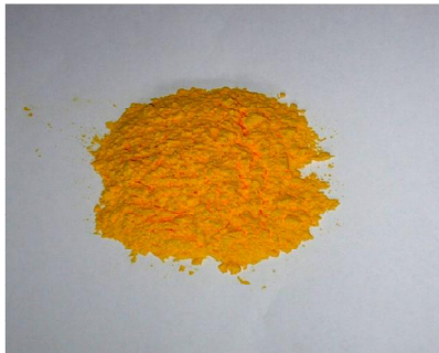
< CELLCOM - AC1000 >